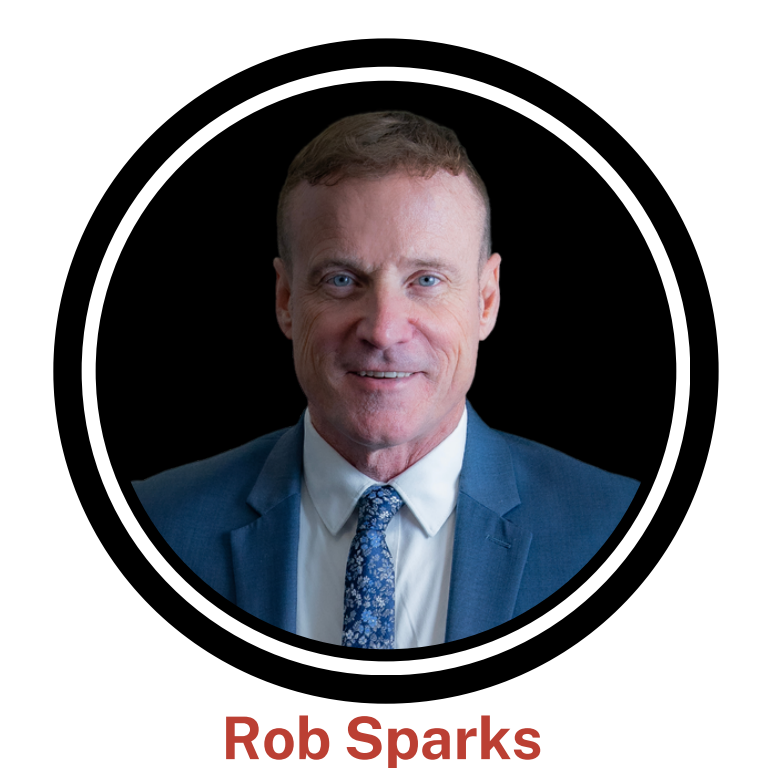
Madison County Corporation for Economic Development